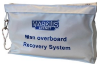
Markusnet MS.00 Sailing

The MarkusNet MS.00 Sailing and MS.02 Boating nets are designed for small deck boats, such as sailing yachts, with no strong railing. Ideal for rescue boats with a light boom and winch (min. 500 kg) or a block and tackle (1:4 ratio), the net includes a 14-metre attachment line with 3 knots and a 25-metre buoyant throw-line in a throw-bag with a chest loop. Packed in a durable PVC/polyester fabric bag with straps and buckles, it's suitable for boats with a lifting height of less than 2 metres to a 90 cm railing or gunwale.