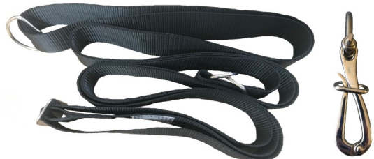
Standard configuration with Senhouse Slip