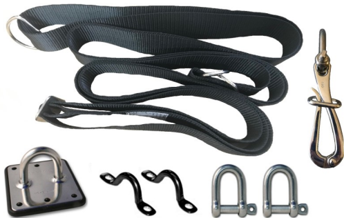
Standard configuration with Senhouse Slip and deck mounting points