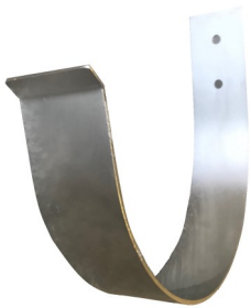
Stainless Steel Lifebuoy Hook