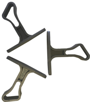
Plastic Lifebuoy Snatch