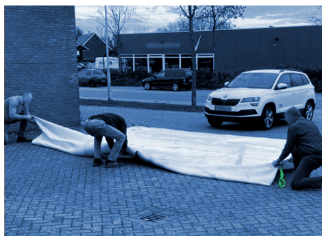
Fold the blanket like a harmonica in 50 cm strips