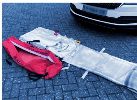
Fold the blanket to the length of the smart bag