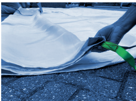
Harmonica folding - the green loops stay on top