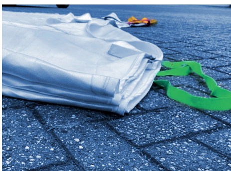
The green loops are on top