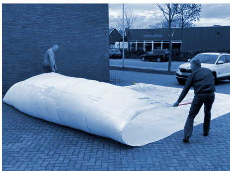
Fold the blanket in half