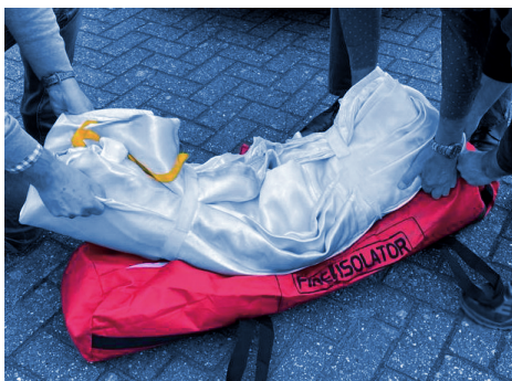
The blanket is ready for another deployment