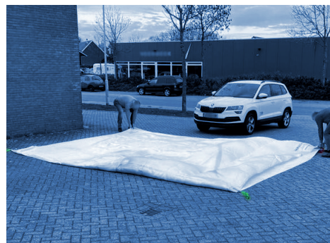
The blanket is folded in half, the green loops are in the middle