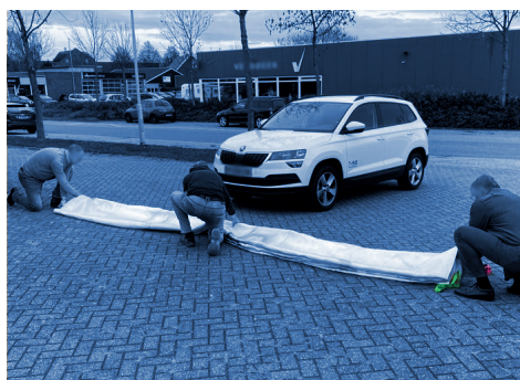
The blanket is completely folded in length