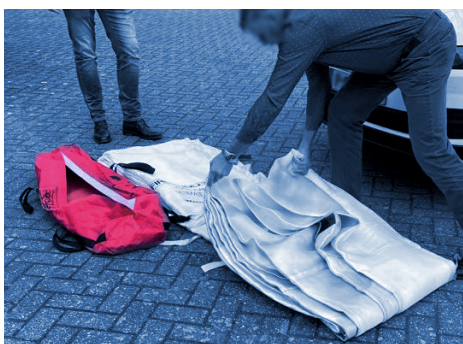
Fold the whole package to the width of the smart bag