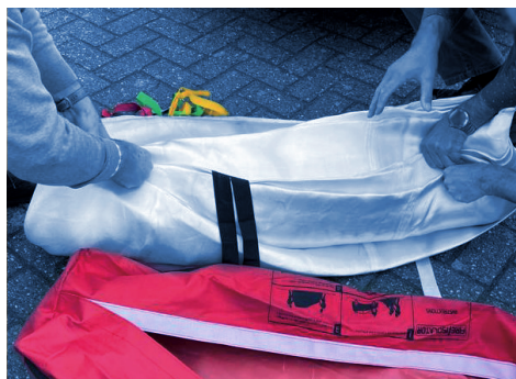
Fix the straps around the blanket using the Velcro