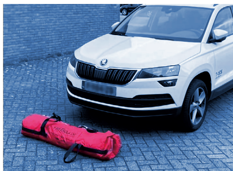
Ready for use