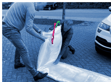
Start folding sideways