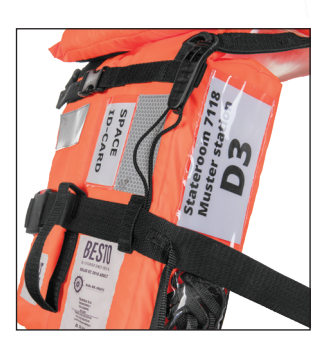
Option Clear pocket for cabin and ID numbers