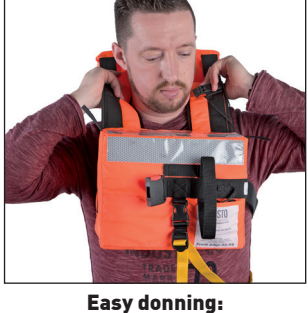
Easy donning: "Big frontal opening" "High comfort"