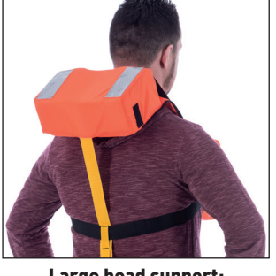
Large head support: "High volume collar" "Collar stabilizer straps"