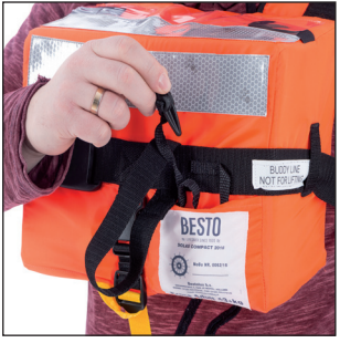
Buddy line + Retainer pocket