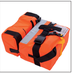
Webbingend retainer pocket