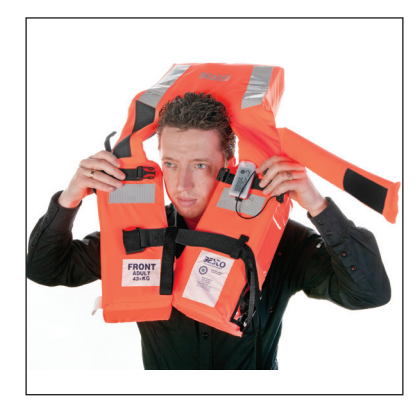
Front opening "easy donning"

The adjustable chin strap holds the head in the optimum position for maximum in water performance (even if the wearer becomes uncon-scious) and optimizes the survival time. This makes the SOLAS EC 2010 very suitable as a pasenger vessel jacket! Can be worn by: Short - Long - Thin - Big people.