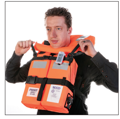
Adjustable neck size