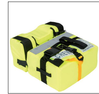
Option: Crew yellow