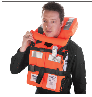
Adjustable chin strap "High freeboard"