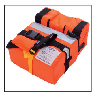
Unique compact storage design: "Light + whistle included/recessed" "No loose webbingends"

BESTO, KOMEET 13, 8448 CG HEERENVEEN, NETHERLANDS, PHONE +31-522 278 140, FAX: +31 522 278 149, INFO@BESTO-REDDING.NL