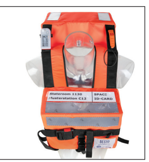
Clear pockets window for cabin & ID number