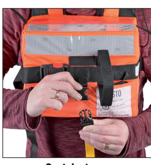
Crotch strap: "Enhanced performance"