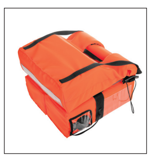
Compact storage size 30 x 34 x 24cm(LxWxH)