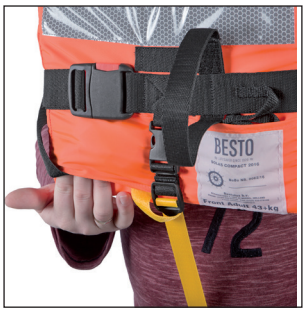
Webbingend Retainer pocket: "No loose webbings"