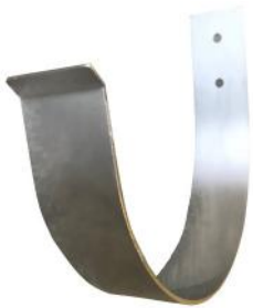
Stainless Steel Lifebuoy Hook