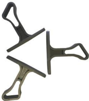
Plastic Lifebuoy Snatch