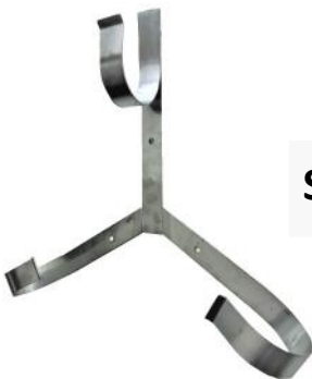
Stainless Steel Lifebuoy 'Y' Bracket